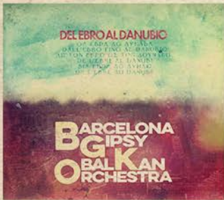
Del Ebro al Danubio (2016)