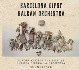
Europe Closes The Border OST (2016)