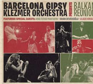
Balkan Reunion (2015)